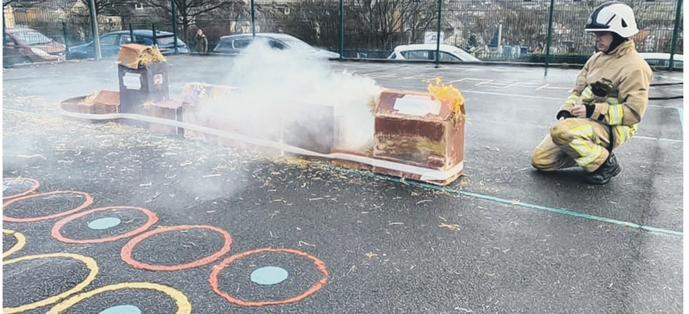
Fire officers assist with putting out the flames in a mock-up of the Great Fire of London.