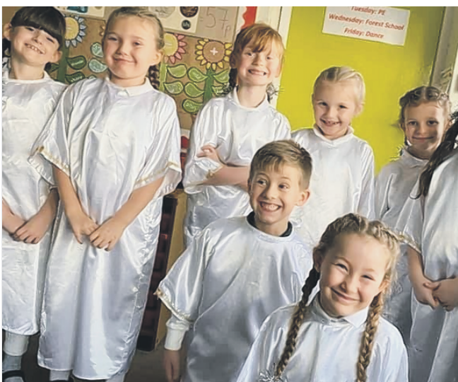
Very angelic! Christmas fun at Airy Hill.