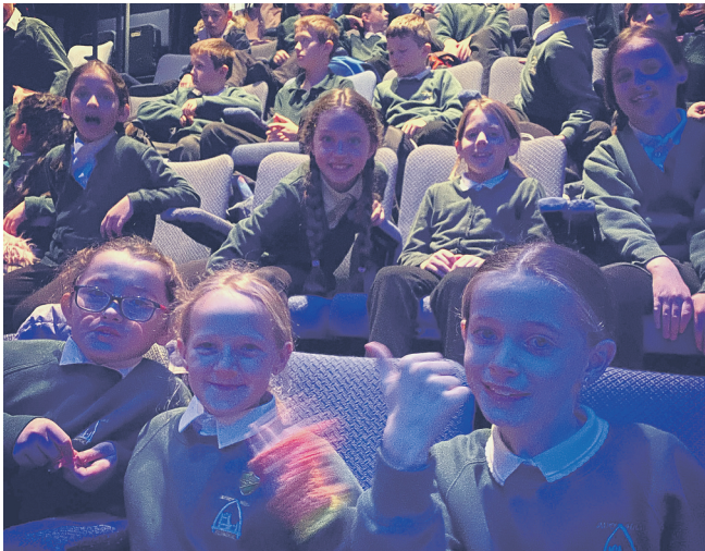
Pupils enjoy a trip to the theatre.