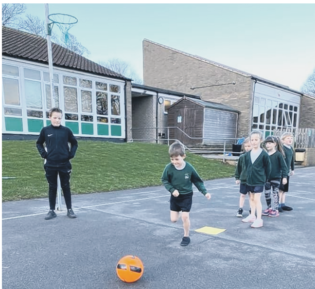
Sports activities in the playground.