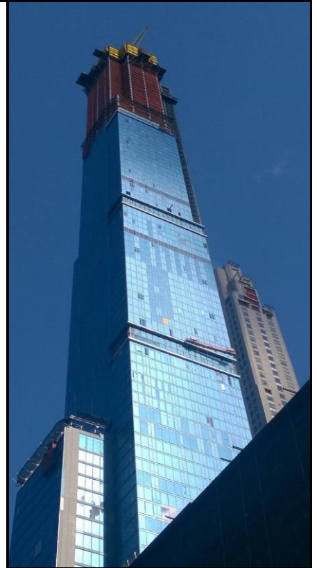
Nordstrom Tower is the same as Central Park Tower