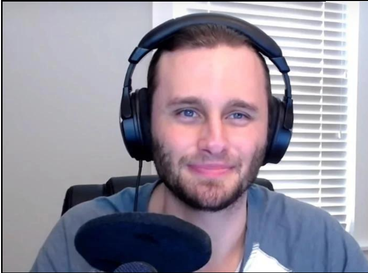
SSundee is a popular gamer, streamer and YouTuber