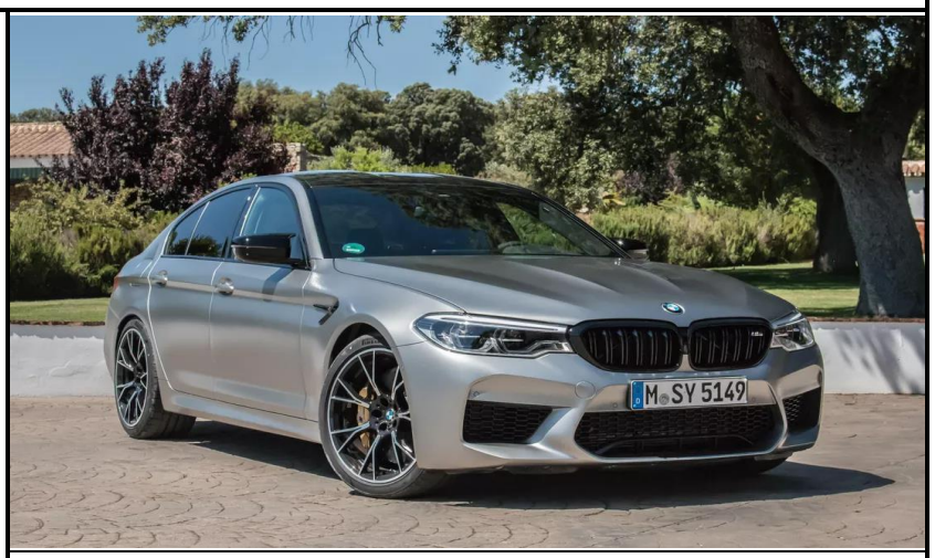
The glorious 2018 BMW M5

What type of sandals do frogs wear? An open toad!