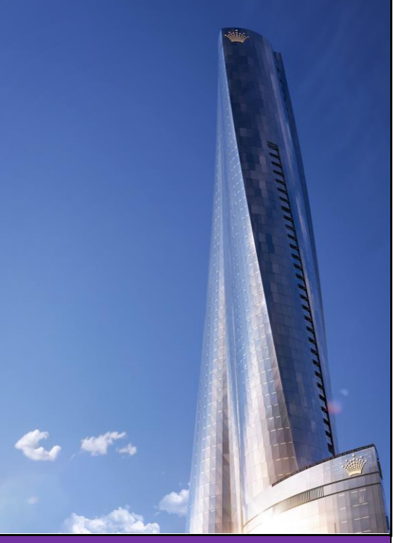
New building costs 2.2. billion dollars!

Emotional wellbeing means feeling good. Sometimes, all your emotions curl up into a little ball and you start crying because you may have been bullied online or outside in your neighbourhood. However, talking about it with people will always help. Physical wellbeing is when you stay fit. To stay fit you have to exercise and when you do get fit you will have a good healthy lifestyle and it helps prevent disease and diabetes.