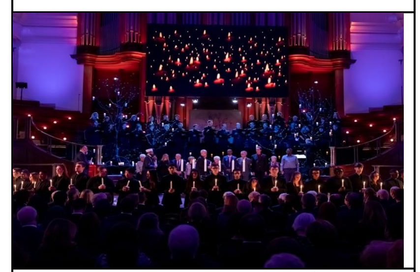
People mark the Memorial Day on 27th January

This week our secret staff member had their birthday. They told us that they prefer classes at school because they like having everyone at school. Their favourite subject is English. Another clue is they support Liverpool. In their spare time they like to bake, go for walks and go for food when it's not lock down. Can you guess? Find out which member off staff we have interviewed next week.